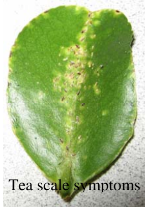
Tea scale symptoms

Chemical. In cooler climates, spring is the best time to apply chemical insecticides as the danger of cold weather has passed and egg hatching often coincides with the warming temperatures. It is essential that thorough coverage of the leaf's under-side is attained. The addition of a sticker-spreader is an effective way to increase coverage. Repeat applications (2-3) made between seven to 10 days apart is necessary to manage a tea scale infestation. Prior to making